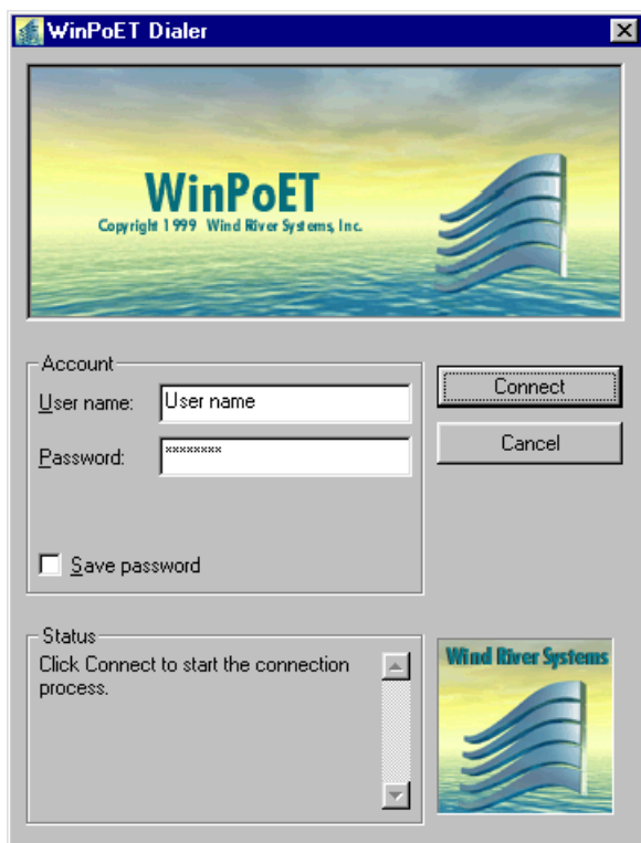
WinPoET Dialer dialog box

For additional information about WinPoET, refer to the WinPoET User's Guide , the online Help , the FAQs document, or visit the WinPoET overview page on the Wind River Web site: http://www.wrs.com/ivasion/html/winpoet_overview.html .